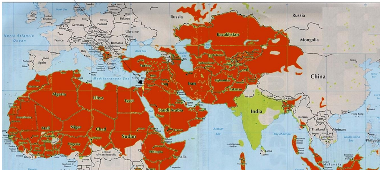
Arab/Muslim countries in red